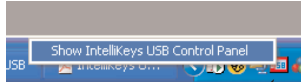
IntelliKeys USB Icon

3. On Macintosh, from the Apple Menu, select Control Panels->Intellikeys USB